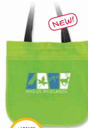
Indispensable Everyday Tote* Size: 17 1/2" x 14" x 3"