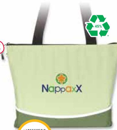
Mini Cooler Sling Size: 8" x 11 1/2" x 4 3/4"